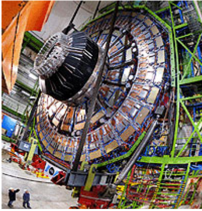
An endcap of CMS is lowered down into its cavern

Compared with these monsters, the LHC itself seems relatively modest. Its tunnel was one of the few parts of the project not purpose-built; it housed the site's previous high-energy particle accelerator, the Large Electron-Positron collider (LEP), which operated from 1989 to 2000. Without the site's other accelerators, it would be useless.