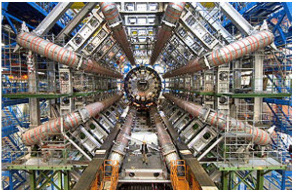
The superconducting coils of the toroidal magnet system, striped in red, awaiting the arrival of the inner detectors and solenoid

Like any high-energy synchrotron, the LHC will be dangerous when running. Beams of particles at near-light speed give off radiation similar to X-rays, so in operation, nobody will be allowed inside the LHC tunnel, or the detector caverns. 'I don't know how long it would take you to die,' said Lamont. 'But you'd die.'